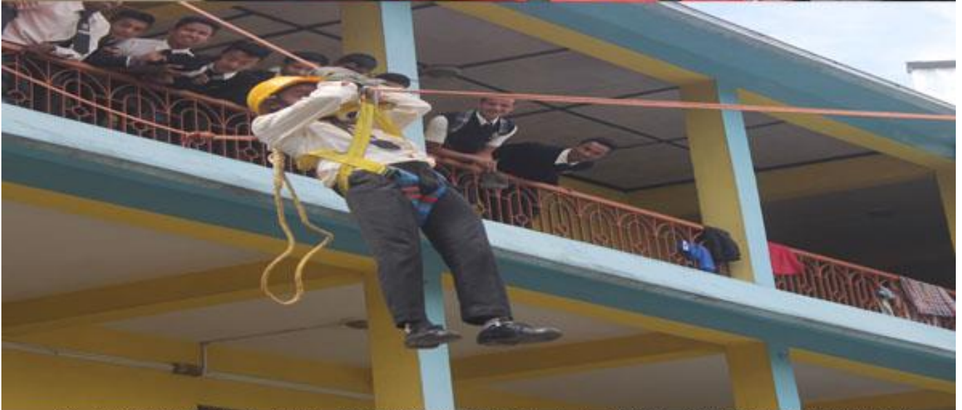
TRAINING CONDUCTED UNDER THE SDO BY THE NDRF AT SUMI, KALIMPONG